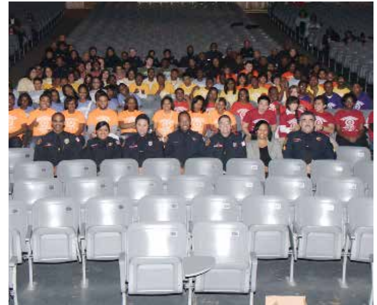
2013 Knowledge Bowl Contestants