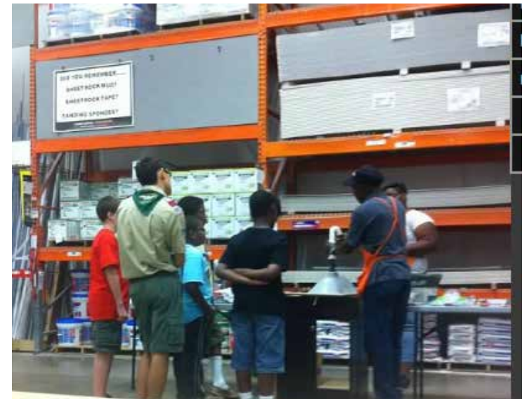
2013 Home Depot Event